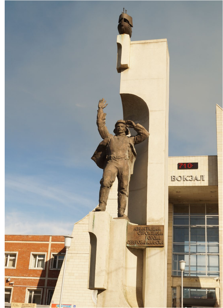
Severobaikal'sk, 2016